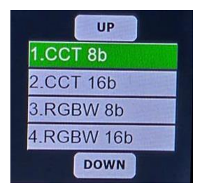
4.8.1. CCT DMX Channels Chart